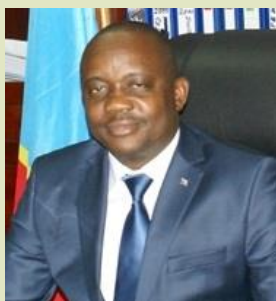
Mr. Jean Paul Nemoyato Bagebole , Minister of the Economy and Commerce, Democratic Republic of the Congo (DRC)