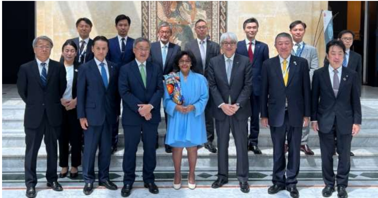
Meeting with AU-NEPAD at the occasion of TICAD7 in Tunis (Aug 2022)