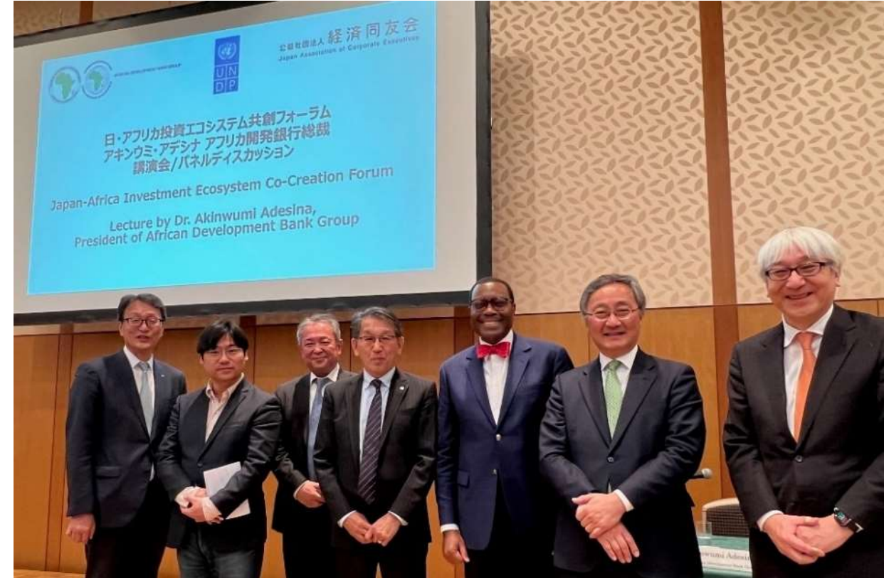
Japan-Africa Investment Ecosystem Co-Creation Forum co-organized by AfDB and Doyukai in Japan(Apr 2023)