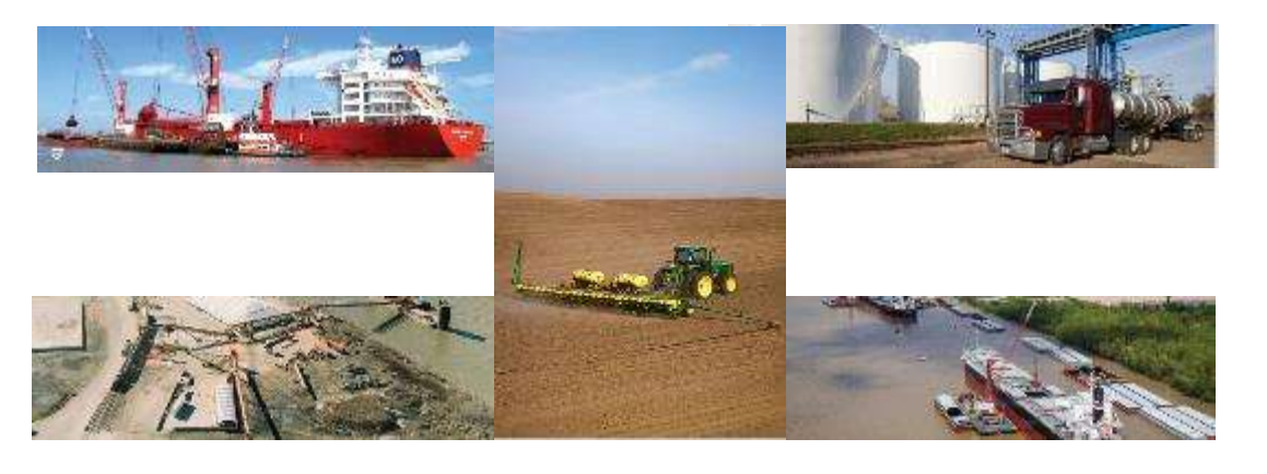
Export of Coffee to Japan