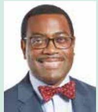
Dr. Akinwumi A. Adesina The Bank's 8th President

The Bank seeks to promote strong, shared and sustainable growth in Africa. Its 2013-2022 Strategy is designed to place the Bank at the center of Africa's transformation and to improve the quality of Africa's growth. In September 2015, President Adesina set out five Bank Group priorities aligned with the 2013-2022 Strategy. These are: Lighting up and powering Africa; Feeding Africa; Industrialising Africa; Integrating Africa; and Improving the quality of life for the people of Africa. The five priority areas are referred to as the High 5s.