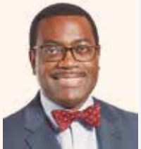
Dr. Akinwumi A. Adesina The Bank's 8th President

The Bank seeks to promote strong, shared and sustainable growth in Africa through five priority areas, which are referred to as the High 5s. These are: Lighting up and powering Africa; Feeding Africa; Industrialising Africa; Integrating Africa; and Improving the quality of Life for the people of Africa. President Adesina set out these five Bank priorities aligned with the 2013-2022 Strategy in September 2015, and subsequent 2024-2033 Strategy is designed to place the Bank at the center of Africa's transformation and to improve the quality of Africa's growth.